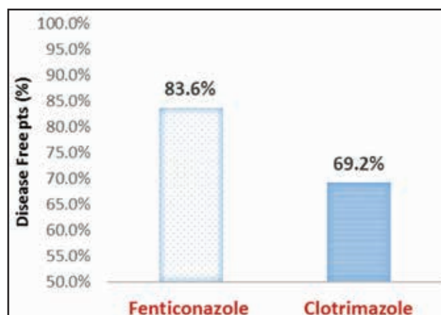
Disease-free patients (%) following Fenticonazole and clotrimazole administration at 4 th week

In randomized comparative clinical trial with clotrimazole, fenticonazole was documented to have better clinical and mycological cure rates with significantly longer disease-free interval rates at 4 weeks following single topical application of 600 mg ovule.